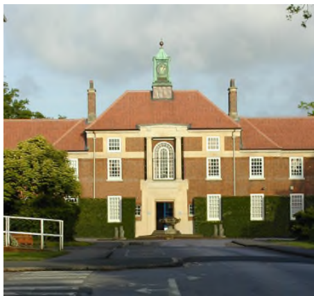
Bethlem Administration Unit

If we are to have medium-secure patients, then surely they need a high level of security! As stated before, there have been eight absconders already , and with the increase in patients, there are likely to be many, many more. Just because 'only one' patient has re-offended after absconding, doesn't necessarily mean that others won't. And if the maximum-security hospitals close, and those patients are transferred to smaller units (like the Denis Hill Unit), then there is an even greater risk of more dangerous patients absconding .